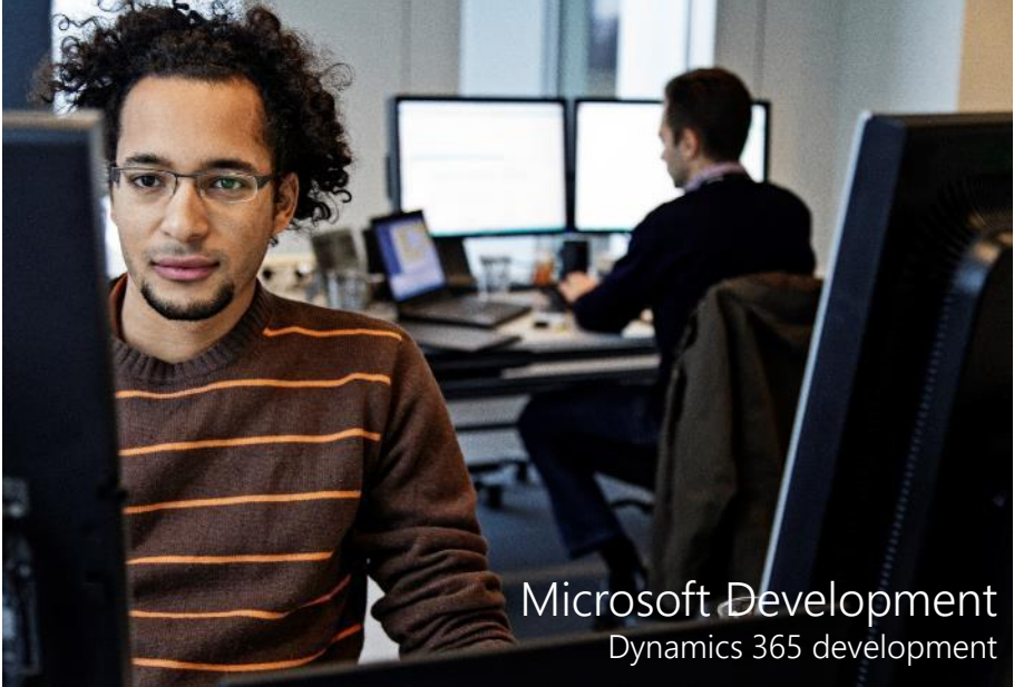
Microsoft Development Dynamics 365 development