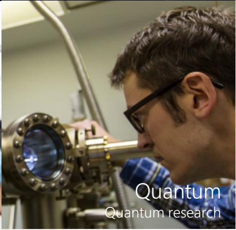
Quantum Quantum research

850 employees 50 nationalities 3 locations