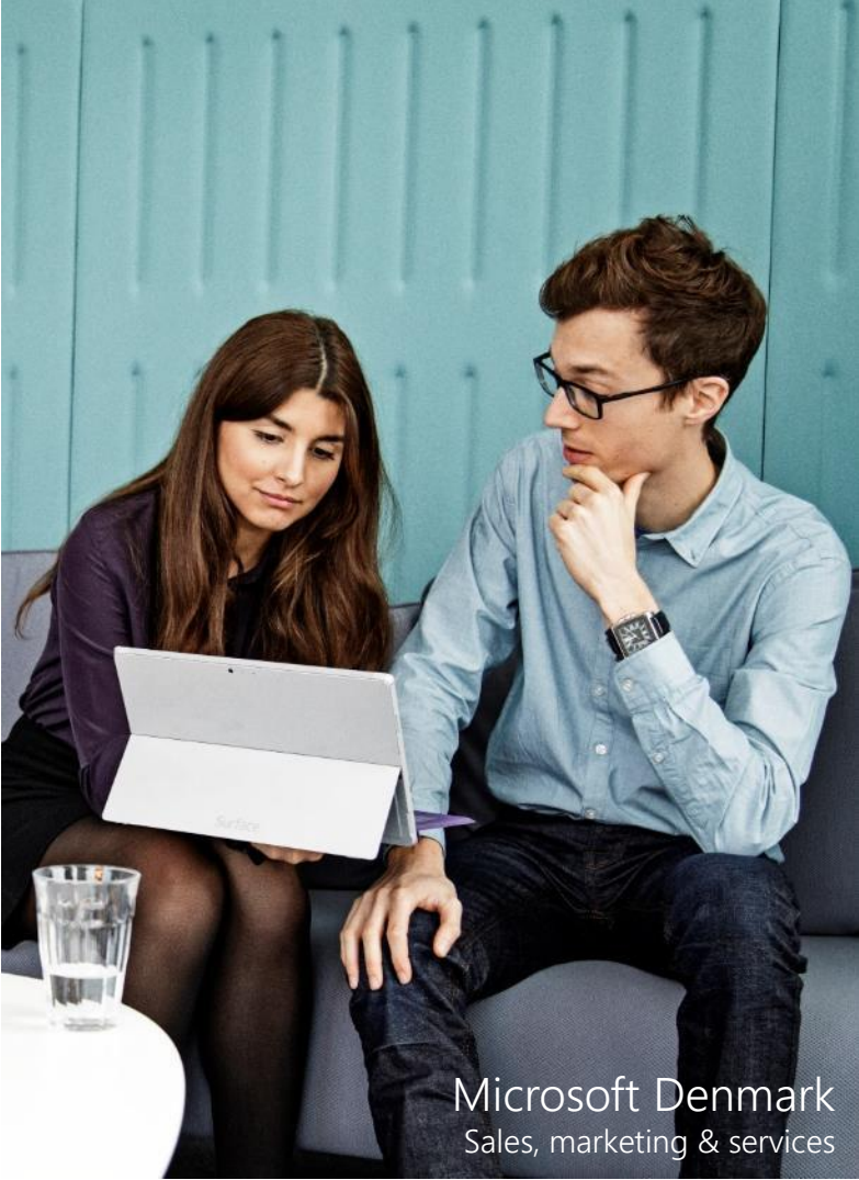
Microsoft Denmark Sales, marketing & services